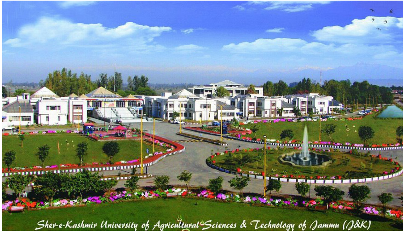
Sher-e-Kashmir University of Agricultural Sciences & Technology of Jammu (J&K)

There is a large-scale educational migration, with thousands of students leaving the region each year to pursue degrees in engineering, medicine, management, law, and emerging fields such as artificial intelligence, biotechnology, and data science in other parts of India or abroad. This outward movement not only places a heavy financial burden on families but also contributes to a long-term brain drain, as many students do not return after completing their studies, thereby depriving the region of skilled professionals who could otherwise contribute to its development. Against this backdrop, the Private University Bill seeks to create a more diversified and dynamic higher-education ecosystem by allowing credible private organizations, educational trusts, and reputed academic groups to establish universities within Jammu and Kashmir under a regulated framework designed to ensure quality, transparency, and accountability.