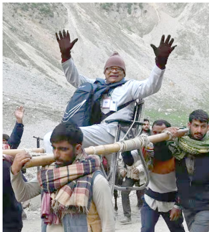
On Wednesday alone, 29,047 devotees

According to official figures, 1,42,861 pilgrims had performed darshan at the holy cave shrine till 7:00 PM on Wednesday, compared to 1,11,975 devotees during the first six days of the Yatra in 2025. The increase of 30,886 pilgrims marks an approximate 28 per cent rise in pilgrim turnout.