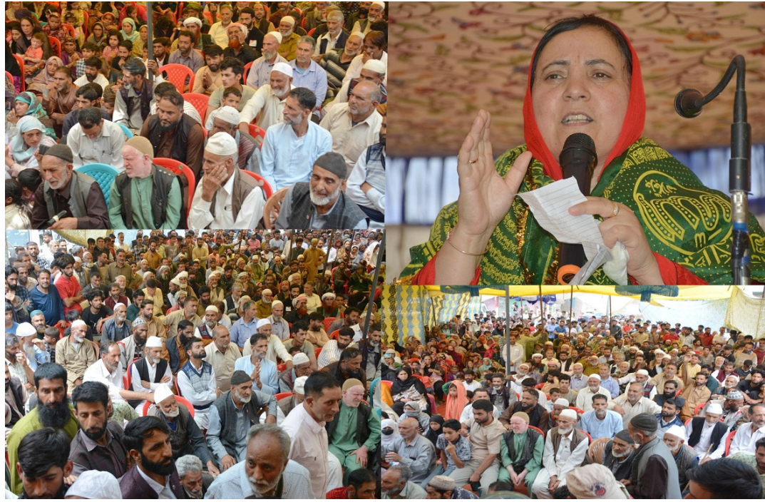
on rural and far-flung areas. The Minister also highlighted various welfare schemes aimed

She said that several projects of public importance have been initiated in recent months and healthcare facilities have been upgraded across Jammu and Kashmir, with particular focus