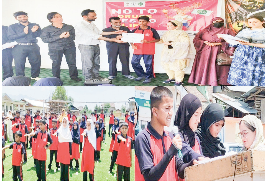
astating impact of substance abuse on individuals, families and society. Blending entertainment with a strong social message, the performance effectively reinforced the objectives of the Nasha

Adding a powerful cultural dimension to the campaign, artists of the Dilkash Dramatic Club presented a thought-provoking thematic skit depicting the devastating impact of substance abuse on individuals, families and society. Blending entertainment with a strong social message, the performance effectively reinforced the objectives of the Nasha