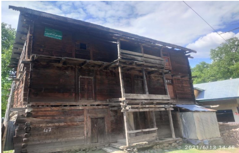
Anwar Shah Kashmiri's ancestral home in Lolab. A few years back, the Jammu and Kashmir government had declared the old wood structure a heritage building.