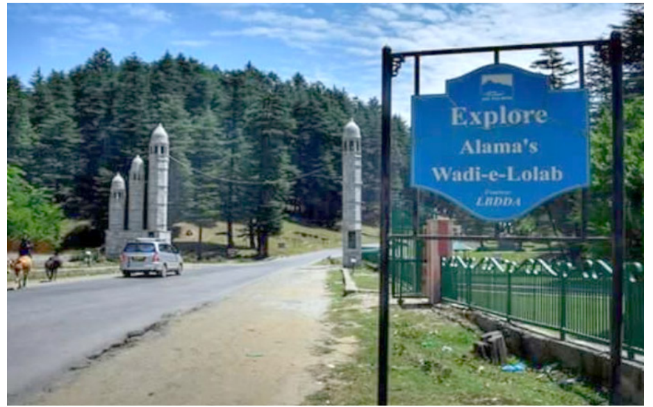
Gateway to Lolab, the famous Kupwara belt that is home to Kalaros