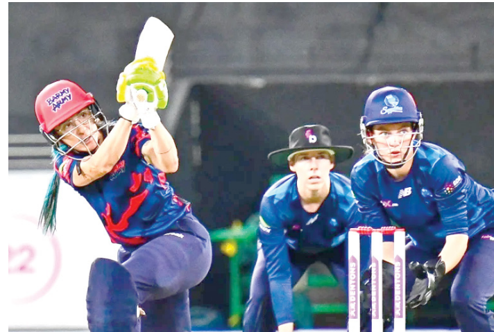
33 times in T20Is before stepping down in 2023. Under her cap-

taincy, Brazil won the South American Women's Champion-