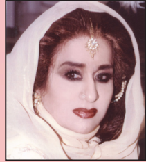
■ SHAHNAZ HUSAIN