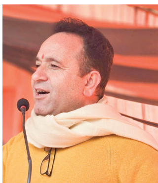
Mantar during the Monsoon Session of Parliament to press for the restoration of statehood

The National Conference has announced a protest at Jantar