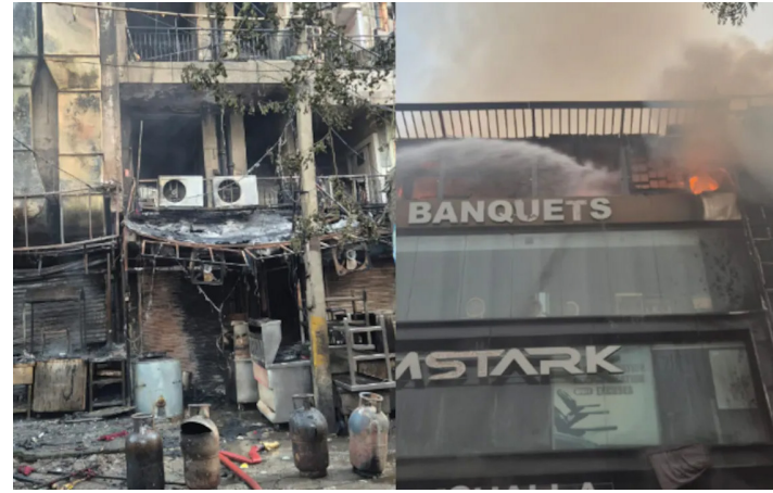
second floor of a nearby building due to thick smoke. Firefighters

According to fire officials, the flames spread quickly from the basement and ground floor to the third floor, also affecting a temporary structure on the rooftop. During the incident, three commercial LPG cylinders exploded, causing panic in the surrounding area. The fire also posed a serious threat to adjacent buildings. An elderly woman, identified as 75-year-old Sita Devi, became trapped on the