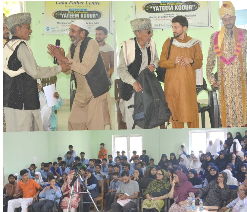
The event concluded with enthusiastic applause from the audience for the meaningful presentation and outstanding performances.