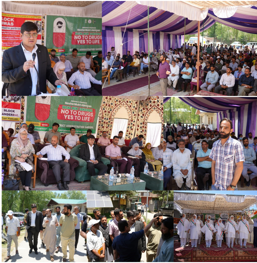
Main Market Tulumulla.

Residents also sought better management of irrigation canals, revival of defunct infrastructure, improvement of public facilities, establishment of library in Tulumulla and deployment of sanitation workers and dustbins at