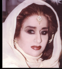
■ SHAHNAZ HUSAIN

Celebrated worldwide on June 21, International Yoga Day is the perfect reminder to slow down, stretch out, and let your inner glow shine through. Yoga is the complete route to physical, emotional and pranic beauty aimed to rejuvenate the skin, tone the body, and reduce signs of ageing!