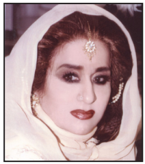
■ SHAHNAZ HUSAIN

Air conditioners have seen a significant surge in recent years, particularly in countries with hot climates like India.