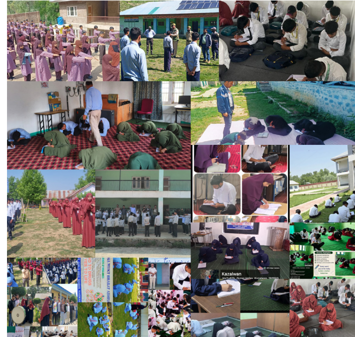
Abuse Control". Around 20 students participated in the competition and highlighted the role of youth as guardians of a drug-

HSS Gadakhud organised an essay writing competition titled "Responsibility of Youth in Drug