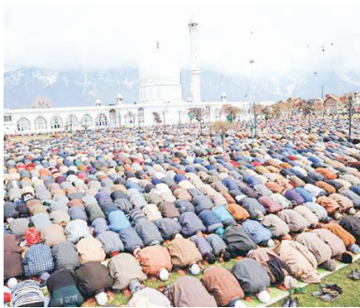
Markets in Jammu, Srinagar and other towns witnessed heavy rush on the eve of the festival, with shoppers purchasing sacrificial animals. Turn on Page 2

Authorities have made extensive arrangements across the Union Territory to ensure smooth observance of the festival. Major congregational prayers are being held at several locations in both Kashmir and Jammu divisions amid heightened security and civic management measures.