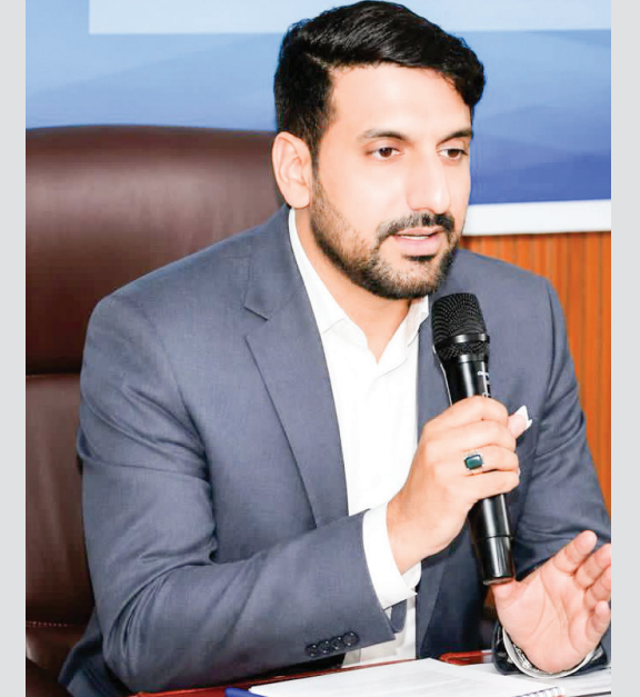
Department of Rural Development Government of Jammu and Kashmir

The meeting was informed that under DDU-GKY