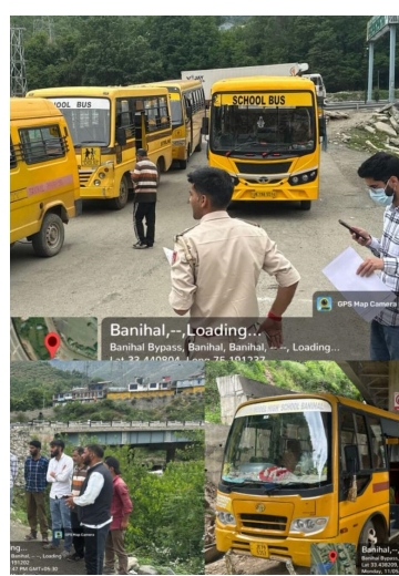
the supervision of ARTO Varun Bhasin, physically examined 14

school vehicles to verify the installation and functionality of mandatory safety equipment, including CCTV cameras, Vehicle Location Tracking Devices (VLTD), Speed Limiting Devices (SLD), and emergency panic buttons, as mandated under the Supreme Court Committee guidelines.