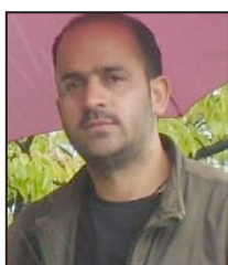
BY M S NAZKI

Modern warfare is no longer determined merely by troop strength and conventional firepower. The battlefield has transformed into a technologically driven arena where artificial intelligence, autonomous drones, cyber operations and precision-guided systems dictate the course of conflict. Military strategy today is increasingly based on capabilities generated through advanced technology rather than sheer numerical superiority.