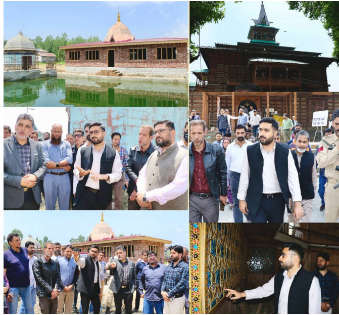
lines and quality of the work as envisioned under the project guidelines.

On the occasion, the DC reviewed the different project components at the site and directed the Officers to ensure strict adherence to set time-