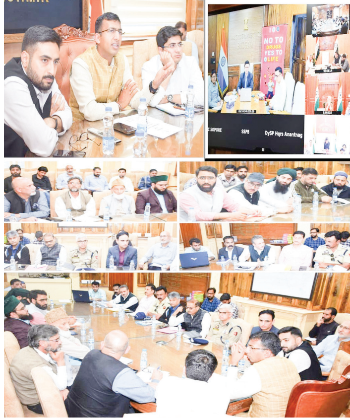
marketplaces, and residential areas. The Srinagar Municipal

In order to maintain cleanliness and create a festive atmosphere, special sanitation drives were directed to be carried out in and around mosques, shrines,