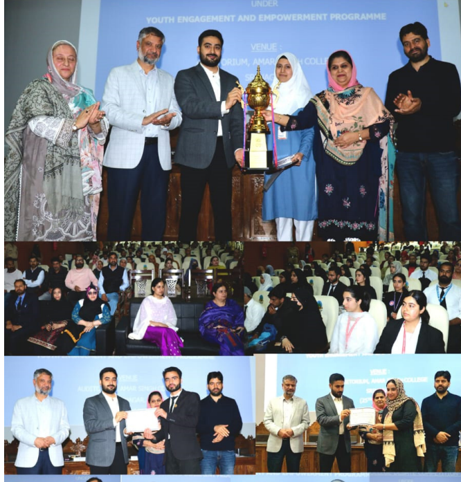
channeling their energies towards positive and

The DC underscored that such initiatives are instrumental in protecting youth from social evils like drug abuse and