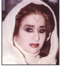
■ SHAHNAZ HUSAIN

Everyone loves their skin, don't they? The scorching summer heat can take a toll on your skin, leading to dehydration, sunburn, and breakouts.