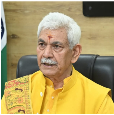
Describing drug inflow into the UT as part of a larger international conspiracy to damage the future of youth, Sinha urged students, civil society

Chairing a high-level meeting, the Lieutenant Governor said the campaign would focus on high-impact awareness programmes and strict enforcement measures to dismantle drug trafficking networks. He announced that a mega "Padyatra" will be flagged off from MA Stadium in Jammu on April 11, while a similar large-scale launch is scheduled in Srinagar in the first week of May.