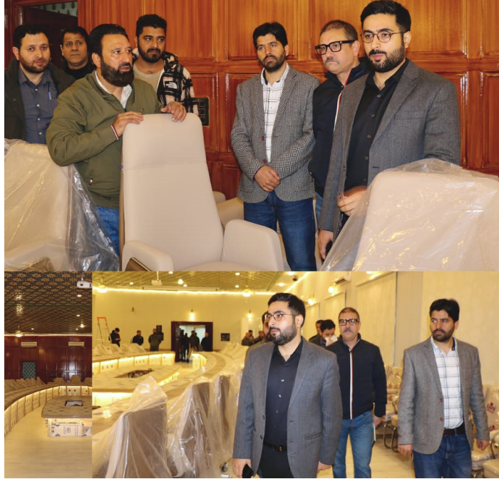
maintaining high standards and ensuring timely completion of the project in accordance with the prescribed specifications. He also

During the inspection, the Deputy Commissioner assessed the progress and quality of works being executed at the site. He emphasized the need for