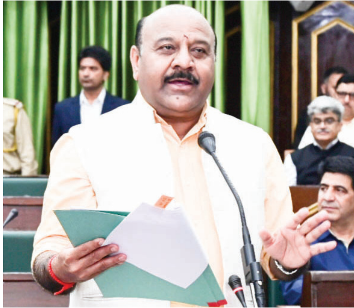
impacted any ongoing development project in the Union Territory.

He said that, of 691 stone crusher units, 527 are operational and 164 are non-functional, including 48 that have been sealed or closed. These units have been operating in compliance with the set regulations and their closure has not significantly