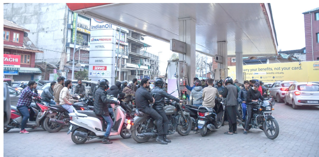
Additional Chief Secretaries and Principal Secretaries of Food and Civil Supplies, the Secretary briefed participants

on steps taken by the Centre to streamline the supply of essential petroleum products and appreciated the coordinated efforts of States and UTs in managing the evolving scenario.