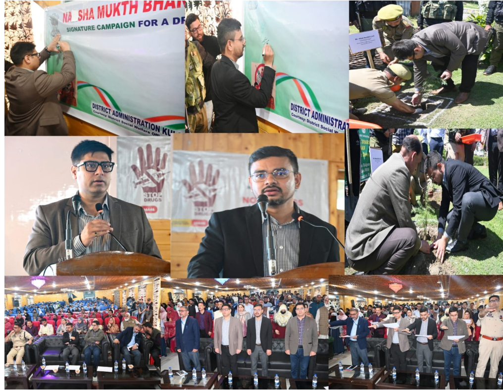
campaign to intensify awareness programmes across the district. The DC further stated that a

He said that a comprehensive activity calendar has been prepared under the 100-day