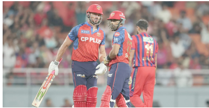
tack, but has sparked as a defensive unit this season.

CHANDIGARH: Punjab Kings (PBKS) can knock off 200-plus chases without fuss, and if they bat first - as they did for the first time this season on Sunday against Lucknow Super Giants (LSG) - they put up record numbers. But cricket matches, whatever the format, are not won by the batters alone. It's their less spoken-about suit, but PBKS have also put together a pretty stellar bowling attack, one that can at-