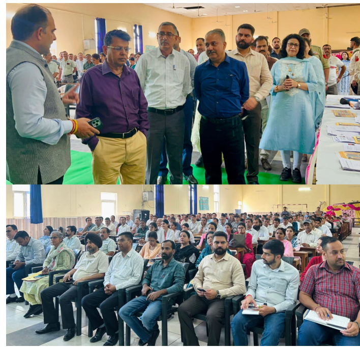
the revision process and directed the concerned officers to intensify

The State Election Commissioner stressed the importance of transparency and accessibility in