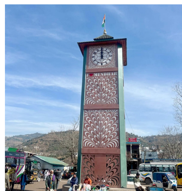
A fresh landmark For Mendhar; The Newly Constructed Clock Tower (Ghanta Ghar) Standing Tall and Proud