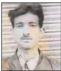
■ MOOL RAJ

Gool is a village in Ramban district with a population of over 50,000. It is situated 52 km from Ramban. Gool pies in the lap of nature. Its greenery is magical, attractive, and eye-pleasing.