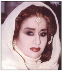
■ SHAHNAZ HUSAIN