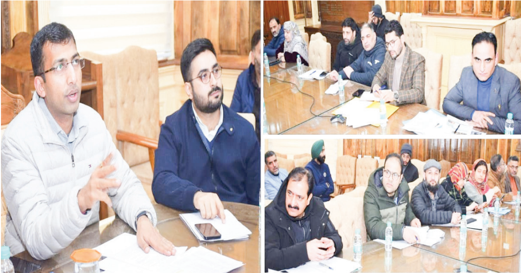
Divisional Commissioner directed IWAI to take possession of land at two identified locations and to conduct a joint inspection to identify land for the third location. It was informed that out of eight proposed locations, four have already been taken over by IWAI.