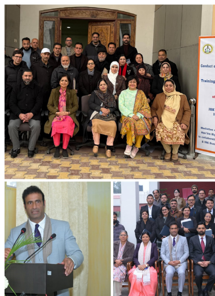
speedy and effective justice. All the sessions remained very

The programme was designed to build a robust cadre of expert mediators and trainers, furthering the mission of providing