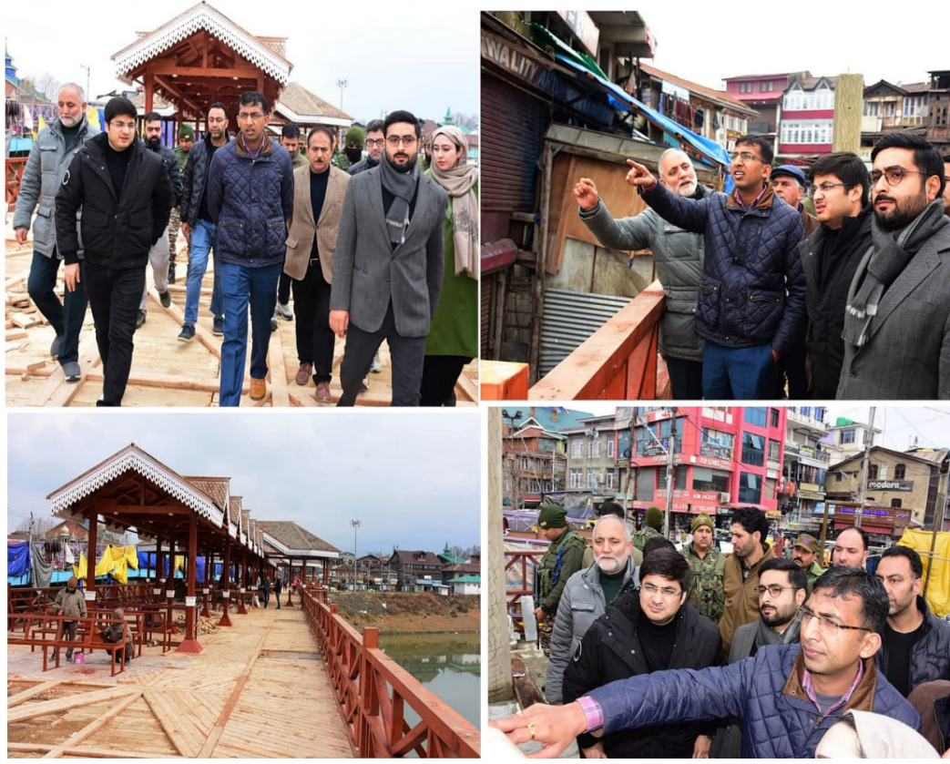
Kadal area. It will provide safe and convenient pedestrian access to the Jhelum Riverfront and

The bridge, once completed, is expected to substantially improve pedestrian connectivity across the Jhelum River and will also help preserve the traditional and heritage look of the Amira