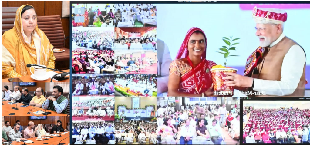
The Minister, on the occasion, also expressed gratitude to Prime Minister for launch-

The Health Minister also called upon the officers to conduct awareness among the masses through electronic, print and social media, so that maximum people can take benefits from this Abhiyaan.