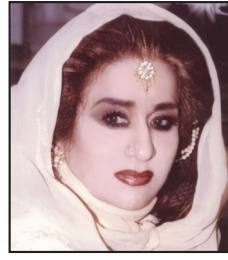
■ Shahnaz Husain

White strong nails free from chips and cracks are what every woman wish their nails look alike. Most of women dream of a set of natural-looking nails something like strong, long, perfectly polished as it enhances beauty of hands.