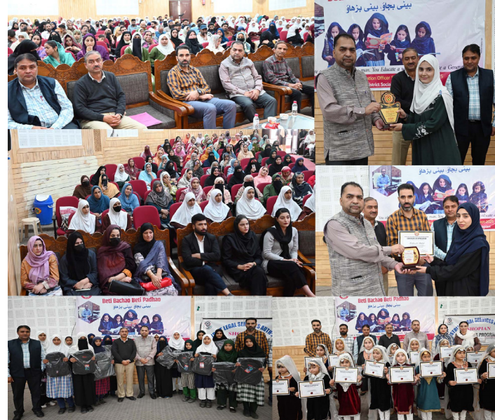
ADDC urged parents, teachers and community representatives to play an active role in ensuring that every girl is educated, nurtured and empowered to contribute towards nation-building.