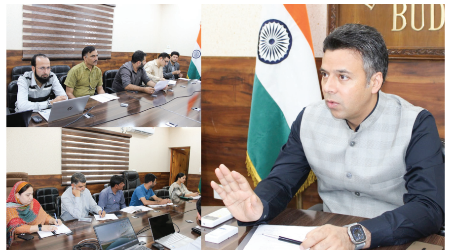
HT News Desk / DIPT

Stresses timely completion of the project for ease of general public