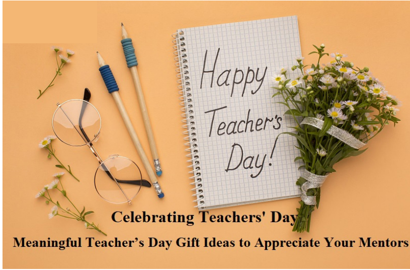
Celebrating Teachers' Day Meaningful Teacher's Day Gift Ideas to Appreciate Your Mentors

India's development story, from the dawn of independence to the powerhouse it is today, has been profoundly shaped by the silent and persistent work of its teachers. Beyond the grand narratives of political and economic reforms, it was the teacher in every village and city who patiently brought literacy to millions, making them participants in the national project. This foundation of education and awareness allowed our society to overcome challenges and embrace new opportunities. We have seen how figures like Madan Mohan Malaviya, through his vision for Banaras