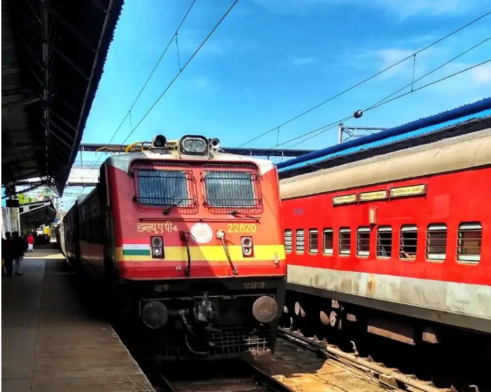
Rajgir, Gaya and Koderma, the minister announced.

Besides, a new circuit train, covering important sites related to Lord Buddha and catering especially to middle-class families, will also be launched, covering Vaishali, Hajipur, Sonapur, Patna,