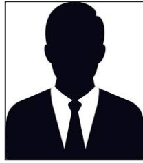
■ By MS Nazki

Amidst the rugged heights of the Pir Panjal range, where winding trails kiss the clouds and isolation often stifles opportunity, a quiet revolution is unfolding – not at the hands of politicians or policy architects, but through the tireless commitment of the Indian Army. Once perceived merely as a bulwark of security and counter-insurgency, the Army has, over time, emerged as a steadfast beacon of hope, resilience, and empowerment for countless communities in this remote frontier.