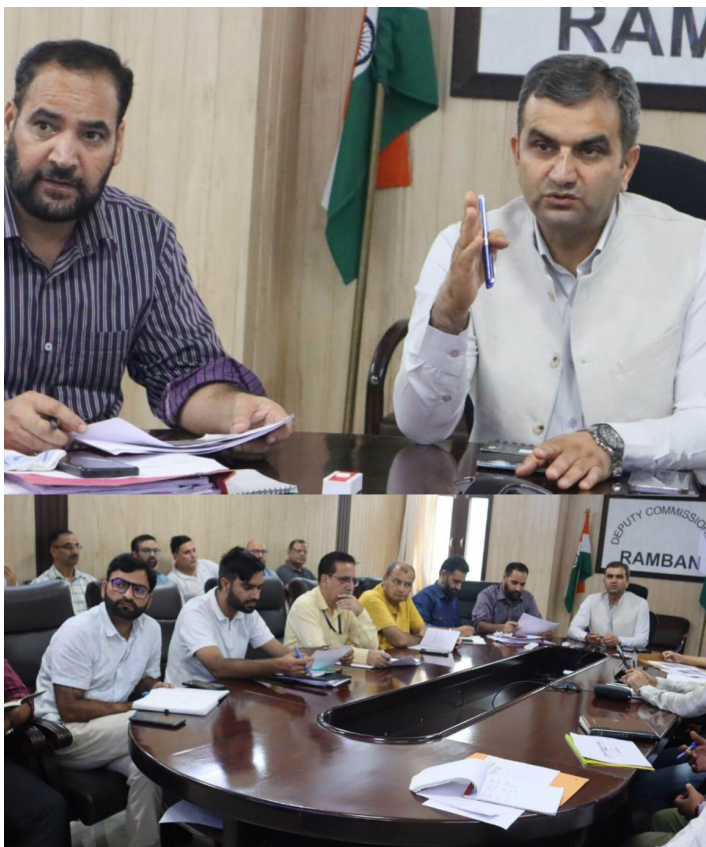
development and self-employment initiatives. He directed departments to work in mission mode to ensure timely benefits reach

During the session, the DC emphasized the need for efficient, transparent, and citizen-centric delivery of schemes including PMAY-G, PMAY-U, MGNREGA, HADP, Mission YUVA, ABHA ID, PM Surya Ghar – Muft Bijli Yojna, scholarships, pensions, ICDS, Social Welfare Schemes, Agriculture and Horticulture programs, Livestock Development initiatives, Rural Livelihoods Mission, skill