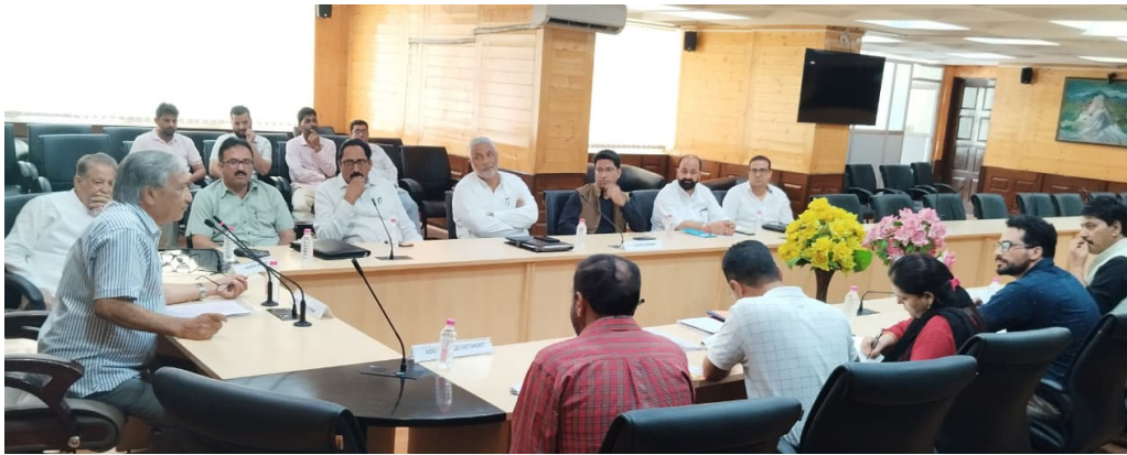
under the IEC framework across rural areas, with active public participation to achieve tangible results. He said the Committee would submit its suggestions and rec-