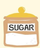
Minimize Your Sugar Intake