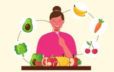
Eat More Fruits and Vegetables