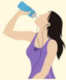
Drink Water Regularly