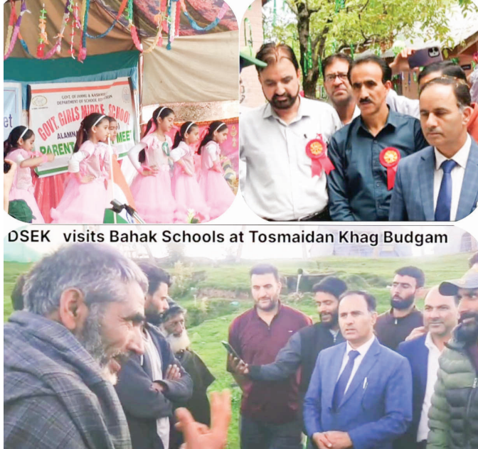
DSEK visits Bahak Schools at Tosamaidan Khag Budgam