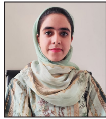
By Tyima Bilal