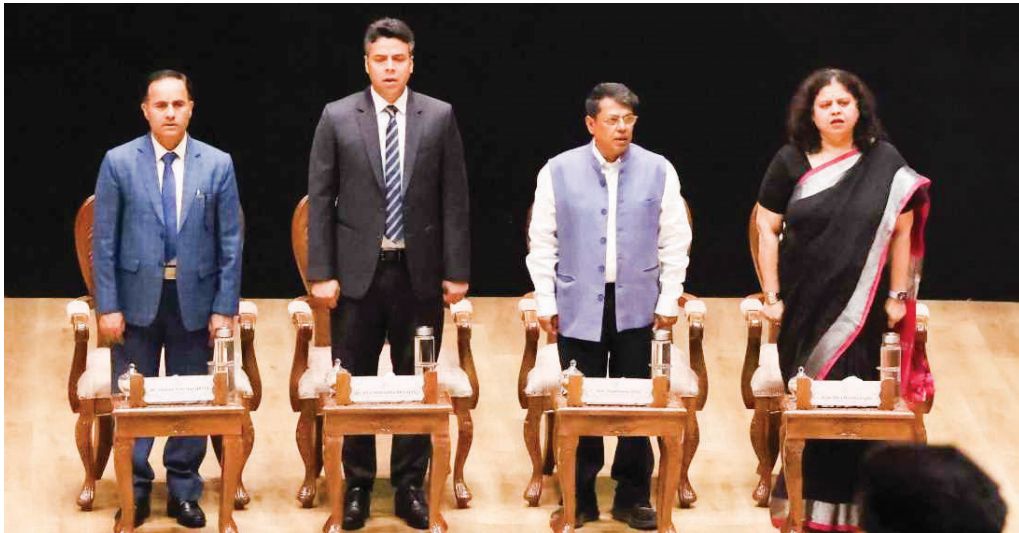
cess stories of weavers, highlighting the resilience and creative spirit of the sector. A special

The celebration included screening of short films produced by NIFT Srinagar on handloom heritage and inspirational suc-