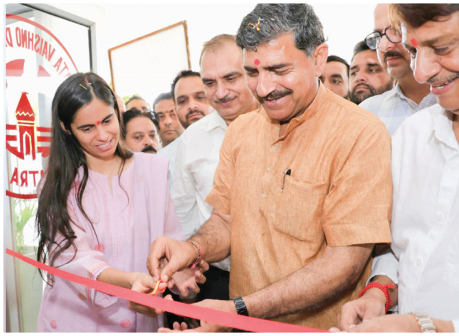
from SHGs, FPOs and local producers. He lauded the creativity

The MP accompanied by MLA and DC inspected the stalls showcasing the rich array of products