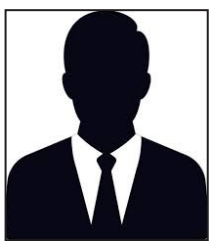
■ By M S Nazki

Students Cross Seva River by Rope Due to Lack of Bridge