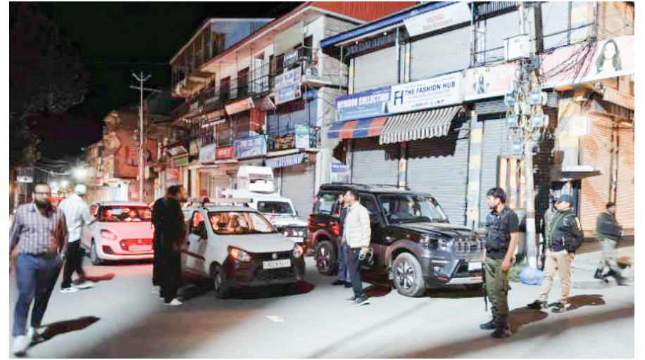
HT News Desk / DIPR

Strict crackdown undertaken, 04 vehicles seized for illegal mining activities