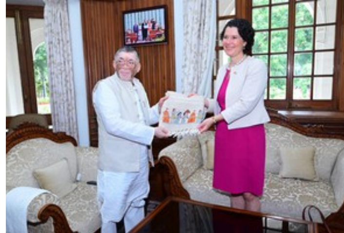
facilities, day care centres, laboratory services, training of health-care personnel, and Information, Education and Communication

"Support is provided for a range of services, including screening and treatment, provision of medicines, blood bank