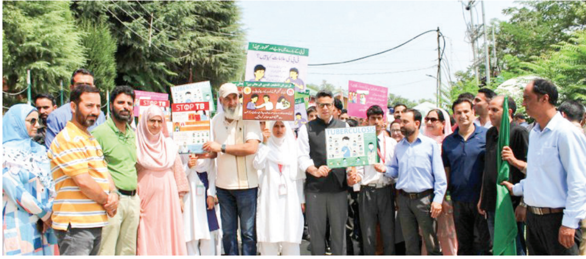
eye-catching IEC materials in local languages. The material consisted of posters and banners detailing TB symptoms, transmission modes, and treatment protocols. Health vehicles were also equipped with public

IEC- health vehicles from RBSK (Rashtriya Bal Swasthya Karyakram) were innovatively decorated with