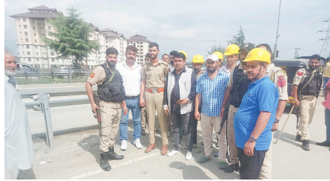
Parimpora. In these zones, several illegal structures, stalls and parked sale vehicles on roads have been cleared.

The operation has been particularly focused on areas like Sanat Nagar, Khayam, Karan Nagar, Hyderpora, Tengpora, Batamaloo, Shaheed Gunj, Bemina, Qamarwari and bypass stretches including Bemina to