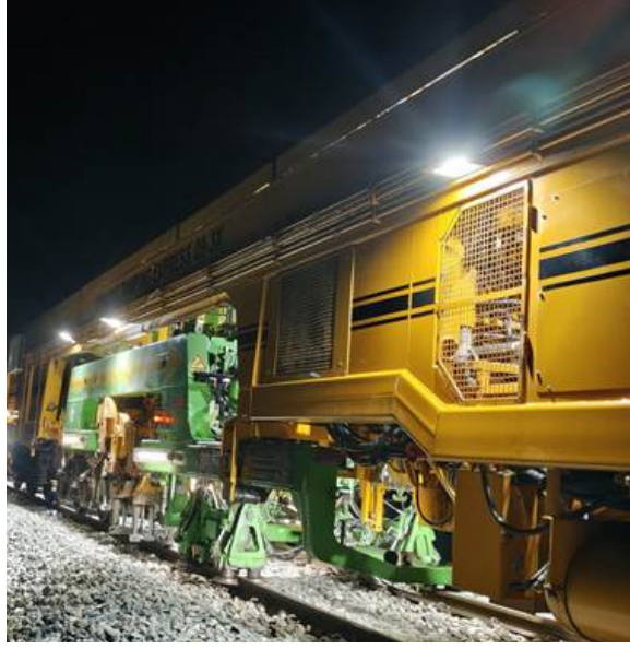
(Tamping machine working in valley section)