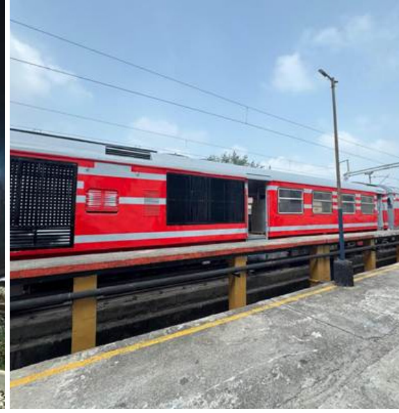
(Upgraded DEMU rake)