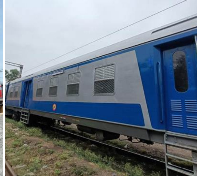
(Upgraded MEMU rake)