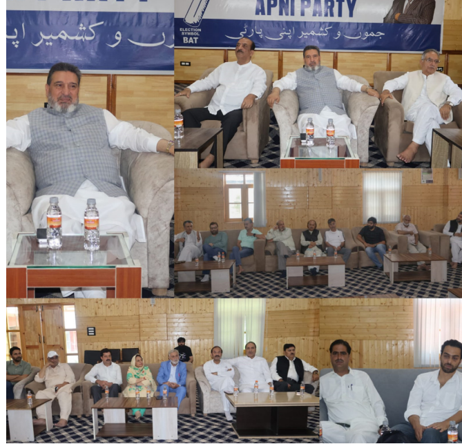
cerned to see that the elected government has failed on every front to address the pressing public issues. This has disappointed the people, who had cast their votes with great hope