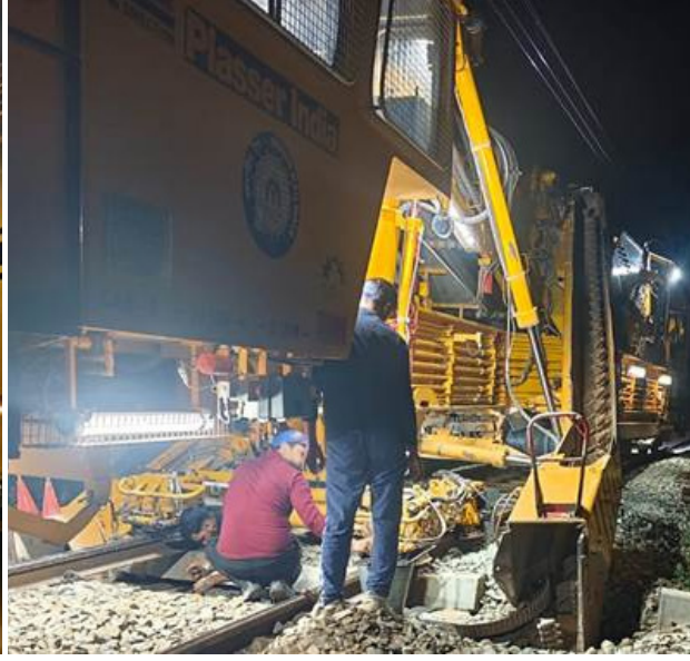
(Ballast Cleaning Machine working in valley section)