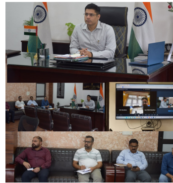
The concerned officers apprised