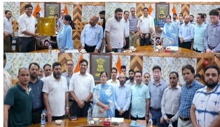
support. He highlighted his enriching experience working in the