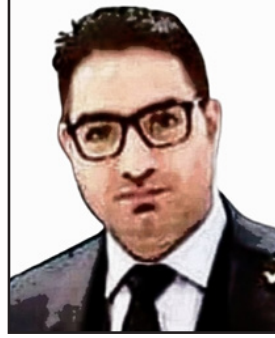
Dr. Tasaduk Hussain Itoo

As major contributors to poor health outcomes, overweight and obesity plague the modern world. Obesity is associated with an increased risk for common illnesses, including type 2 diabetes, hypertension, degenerative joint disease, sleep apnea, cancer, including other diseases.