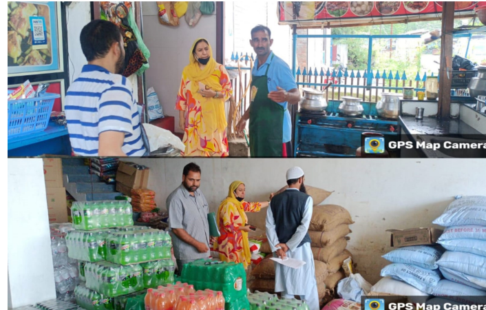
report to our office. It's a collective responsibility to keep our markets

He further added, "People who suspect that they are being sold substandard or expired items can