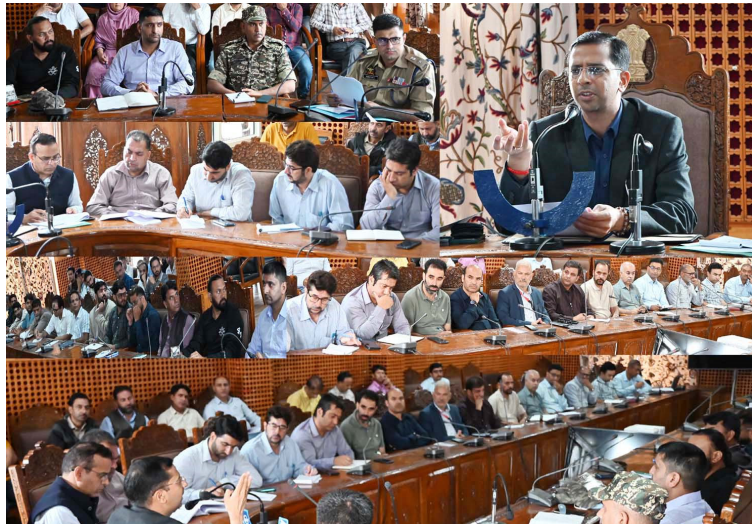
sanitation, traffic, seating, health-care, fire services, decoration, illumination, logistical and security services arrangements were deliberated upon and fixed among concerned departments.

Adequate and proper arrangements including PAS, uninterrupted power supply with back up, potable water facility, refreshments,