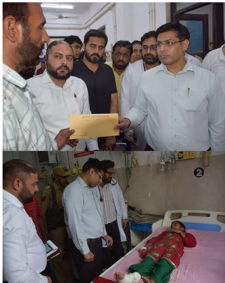
Commissioner, Additional Deputy Commissioner, ACR, Tehsildar Haveli and other senior district officers were also present at the hospital. The Deputy Commissioner

As immediate relief, the Deputy Commissioner disbursed financial assistance under the Red Cross Fund, with ₹1,00,000 provided to the family of the deceased child and ₹50,000 each to the families of the injured children. Additional District Development