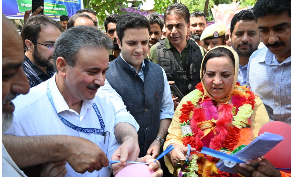
structured NTPHC will play a vital role in improving the health outcomes of the local population,

Addressing a large public gathering after the inauguration, Minister Sakeena Itoo emphasized that the Omar Abdullah-led government is fully committed to bringing all essential public services to the doorsteps of people in rural and far-flung areas. She noted that the newly con-