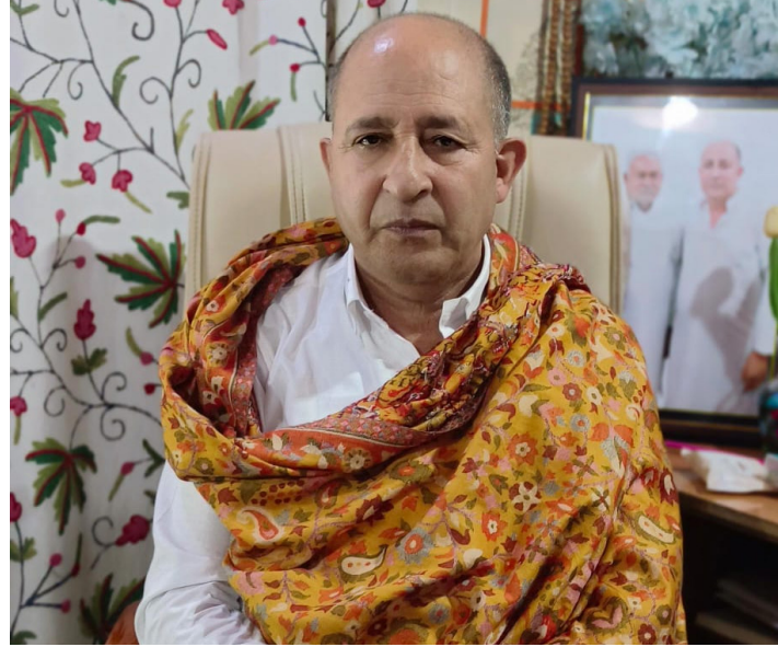
address the long-pending demand for regularisation of daily-wage

crop insurance, or timely access to markets. We demand the waiver of Kisan Credit Card (KCC) loans for small and marginal farmers, and the introduction of zero-interest agricultural loans to boost productivity," said Shaheen. He further stressed the need for a comprehensive rural development package that includes: Revival of defunct irrigation canals and lift irrigation projects Establishment of cold storage and local mandi networks Deployment of mobile soil testing units and agri-clinics Promotion of organic and high-value crops suited to local conditions Shaheen also called upon the Union Government and the LG administration to immediately