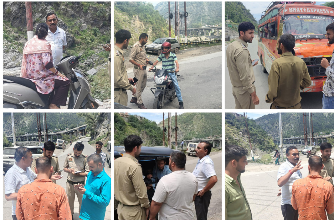
for overloading passengers, 24 drivers without driving licenses, 3 vehicles without fitness certificates, 3 without Speed Limiting Devices (SLD) and 4 other violations under Section 177 of

The drive covered key areas including Ballwat, National Highway, Ramban, Maitra, and surrounding regions. During the operation, over 300 vehicles were checked for violations of the Motor Vehicles Act. As a result, 75 vehicles were e-challaned for various offenses. These included 6 vehicles without Pollution Under Control Certificates (PUC), 21 riders without helmets, 5 vehicles without insurance, 1 without a valid route permit, 9