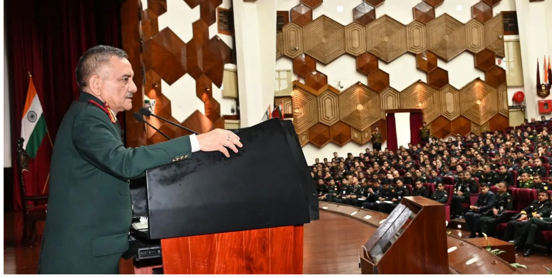
Later, while interacting with the faculty of the college, General Chauhan laid stress on integration and jointness imperatives, capability development, Aatmanirbharta and an in-depth understanding of the transformative changes being pursued in the military.

Addressing the student officers of 81st Staff Course, permanent staff of the college and station officers of Wellington, General Chauhan emphasised on important aspects of Tri-Services synergy demonstrated during the successful operations by the Indian Armed Forces.