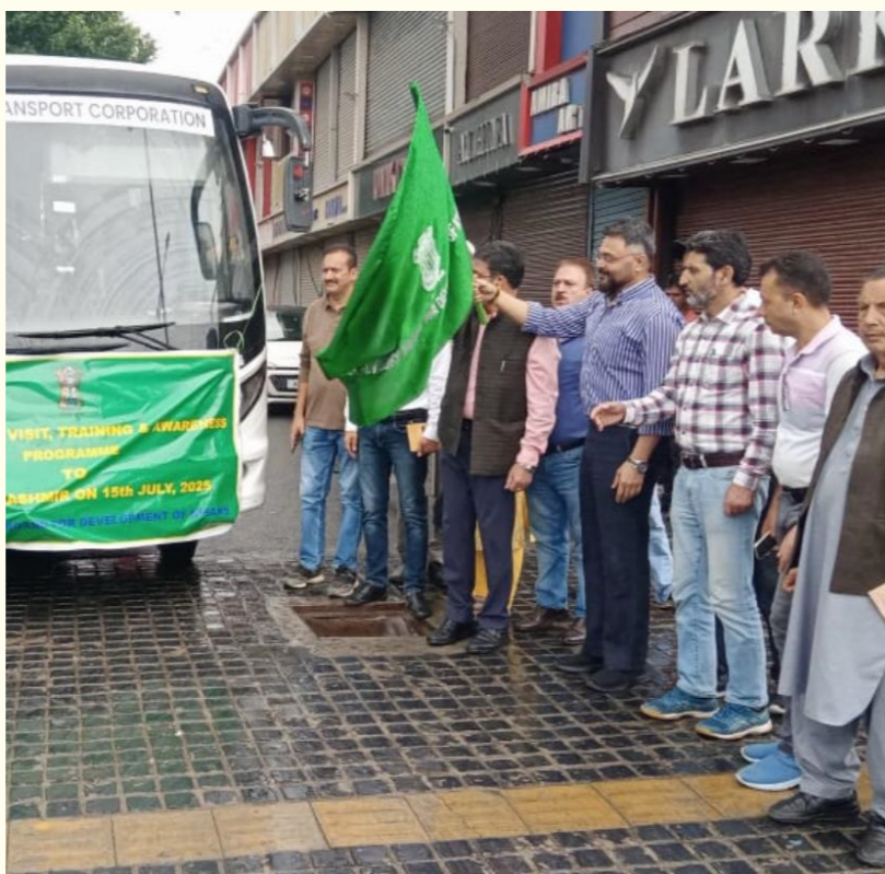
Kashmir. The Secretary advised the farmers to optimally utilize initiatives of the government and take full ad-

He emphasised the need to acquaint the farmers with the modern agriculture technology so that they succeed in doubling their income, contributing towards sustainable agriculture development in Jammu and