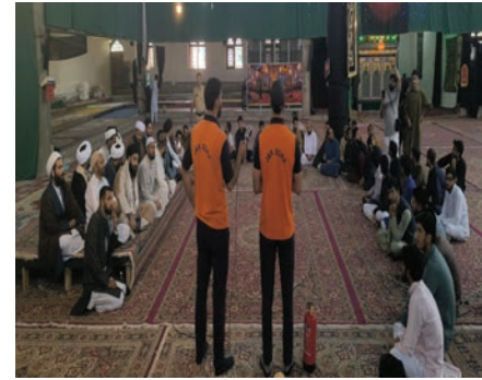
NGOs, sabelgal owners, and volunteers from different districts. The feedback