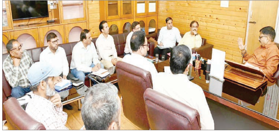
The meeting also reviewed the progress on the ongoing projects of Water Supply Schemes in the region.

The Minister also stressed the need for regular water quality tests to ensure the provision of safe drinking water to the public. He directed the Jal Jeevan Mission (JJM) officials to prioritize water quality monitoring and take corrective measures wherever necessary.