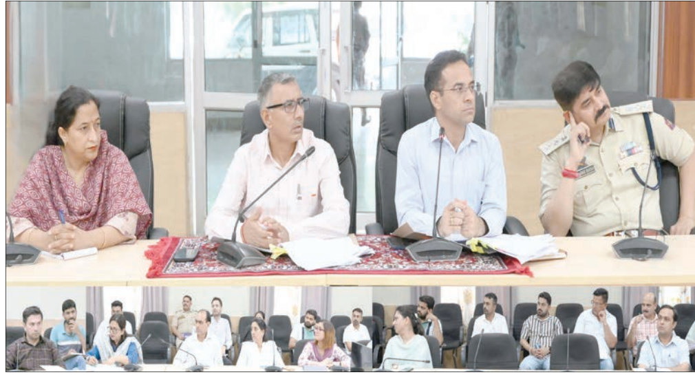
The meeting was informed that the Medical and emergency preparedness has been given

tres to enable real-time announcements and emergency advisories, while print, electronic and social media platforms are being utilized to ensure pilgrims receive timely updates on cut-off timings and safety protocols" he added. Speaking at the meeting, SSP Virender Singh Manhas outlined a robust multi-tier security deployment strategy featuring enhanced surveillance mechanism with special focus on sensitive zones and strategic security positioning around langar locations. "This comprehensive monitoring system will ensure pilgrim safety throughout their sacred journey," he added.