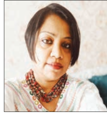
By Tushi Deb

In the kaleidoscope of national progress, there are moments when infrastructure ceases to be merely functional and acquires the character of a developmental metaphor. The Chenab Bridge—poised as the world's highest railway arch, towering above the windswept river in Jammu and Kashmir—is one such creation. It is not just a marvel of civil engineering but a monument to the Narendra Modi government's reimagining of nationalism and development.