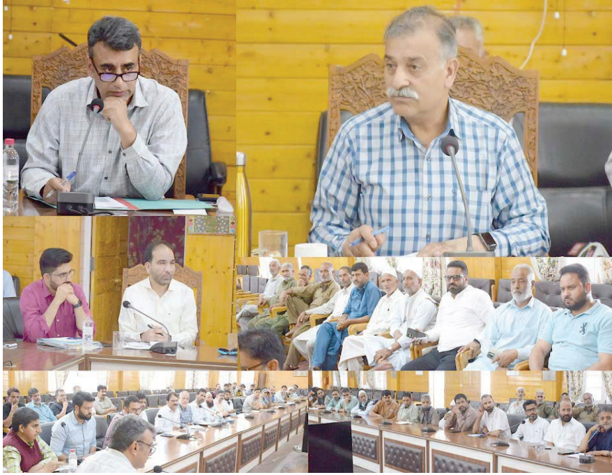
ensure all necessary arrangements are in place well in advance.

On the occasion, DC directed concerned officers from departments including PDD, Jal Shakti, R&B, Health, Fire & Emergency Services, Food Civil Supplies, Police and Municipal Committees to stay alert and