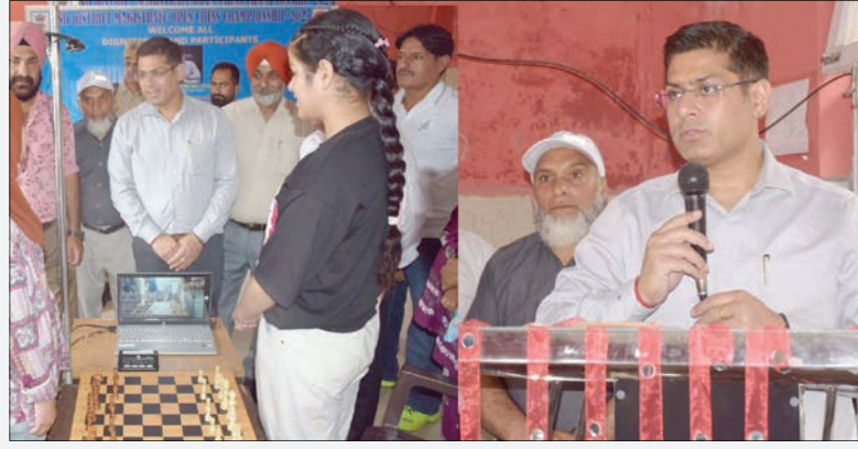
The championship aims to promote strategic thinking and mental agility among the youth.

ing their role in fostering not only physical fitness but also mental strength and discipline. He lauded Youth Services and Sports Department and the school administration for promoting such intellectually enriching activities. He also encouraged students to actively participate in diverse sports events to ensure holistic development. A total of 70 players, including 55 boys and 15 girls from across the district are participating in the championship, reflecting growing interest in mind sports among the youth of the district.