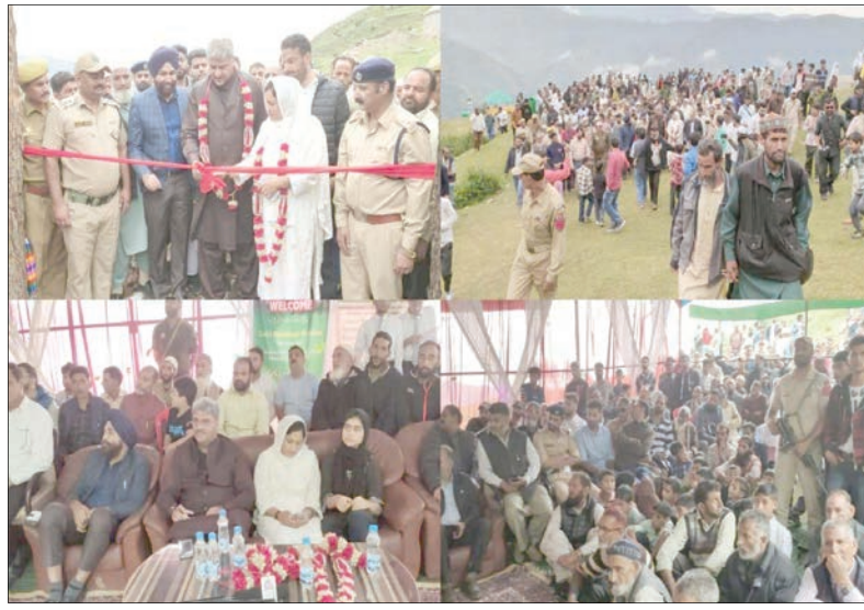
the youth to take pride in their environment and play a proactive role in

the region. The inaugural ceremony featured a vibrant cultural programme presented by local artists and school students, adding colour and warmth to the event and reflecting the whole-hearted community involvement in the project. In his address, the MLA appreciated the Forest Department's initiative in creating a recreational and ecological asset for the people of Banihal. He hoped that the Nagar Van Doba will also boost local tourism and provide a peaceful space for community interaction. The DDC Chairperson commended the collaborative efforts of the Forest Department and the local administration in transforming Banihal into an emerging eco-tourism hub. She urged