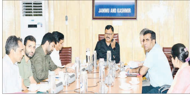
The Minister also emphasized the importance of studying and replicating best practices and models from other parts of the country to enhance TRI's capabilities. He envisioned TRI as a hub for innovative research,