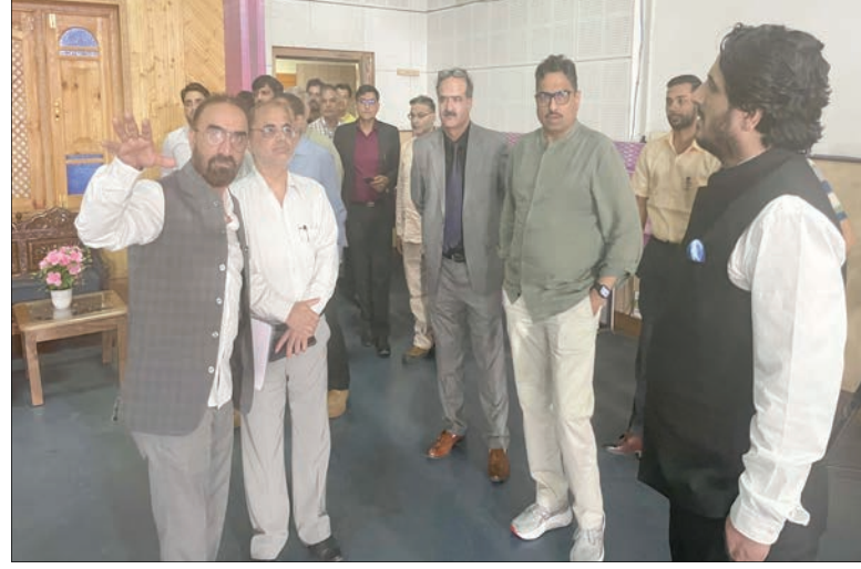
expressed keen interest in exploring new projects for the production of