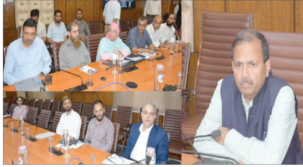
beneficiaries. He also called for closely monitoring the recruitment process to ensure timely filling of vacancies critical to the effective implementation of programmes.

ensuring wide coverage of eligible beneficiaries. He specifically reviewed the physical and financial progress on the department across the Union Territory. Key schemes reviewed during the meeting included Mission Poshan, Saksham Anganwadi 2.0, Mission Vatsalya, Mission Shakti, Integrated Social Security Scheme (ISSS), Ladli Beti, Beti Bachao Beti Padhao, Marriage Assistance Schemes, and various welfare initiatives for tribal communities, women, children, the elderly and persons with disabilities. The Principal Secretary directed for timely disposal of pensions, loan assistance and scholarships to the intended