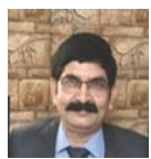
By Vinod Chandrashekhar Dixit

Viksit Bharat 2047 is the government's vision to transform the country into a self-reliant and prosperous economy by 2047. Viksit Bharat 2047 is indeed a visionary plan by the Indian government to transform the country into a self-reliant and prosperous economy by 2047, marking the 100th year of India's independence. This initiative focuses on sustainable development, economic growth, and improving the quality of life for all citizens. Viksit Bharat means 'Developed India'. Viksit Bharat 2047 is the government's vision to drive the mission of making India a completely developed nation by its 100th anniversary of independence in 2047. The vision is based on four pillars: Youth, Poor, Women and Farmers.