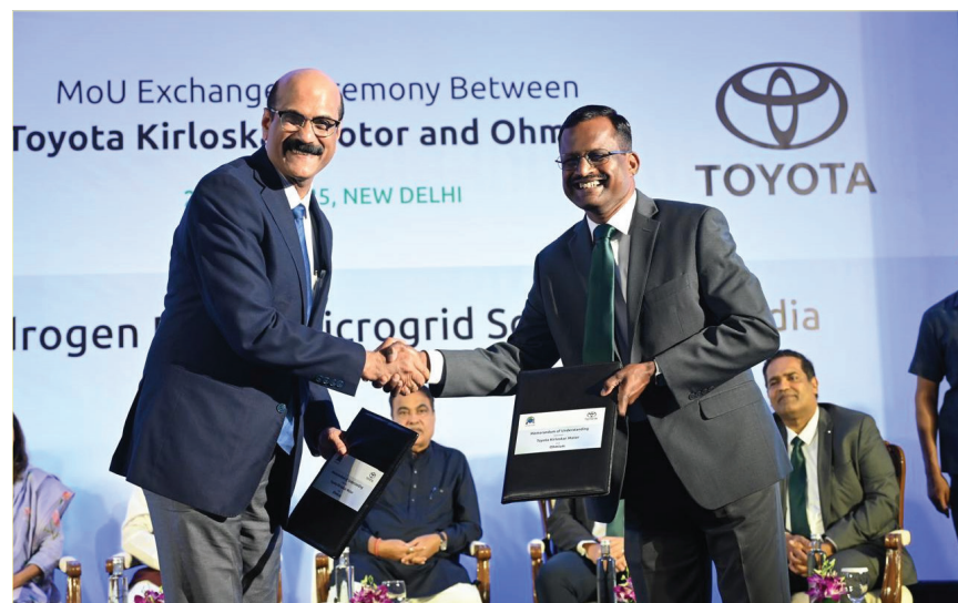
previously led hydrogen efforts with its Toyota Mirai FCEV pilot and a recent fuel cell module supply agreement with Ashok Leyland.

The move aligns with India's National Green Hydrogen Mission and broader vision of energy independence by 2047 and net-zero emissions by 2070. TKM has