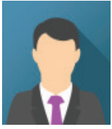
MOHD AMIN MIR

In the vast canvas of Indian political history, very few leaders have managed to leave a mark as deep and transformative as that of Prime Minister Narendra Modi. A statesman of rare determination, strategic foresight, and grassroots appeal, Modi has redefined the contours of governance, development, and diplomacy in India. His tenure has been marked not just by economic and infrastructural growth, but by a deep psychological transformation of the Indian people—one that has instilled pride, purpose, and belief in the promise of a 'New India'. From a modest background as a tea-seller to becoming the Prime Minister of the world's largest democracy, Modi's journey embodies the spirit of aspiration and hard work. But it is not just his story—it is the story of a billion Indians who see in him a reflection of their own struggles, ambitions, and dreams. The Ground Beneath the Reforms: Empowering the Last Person