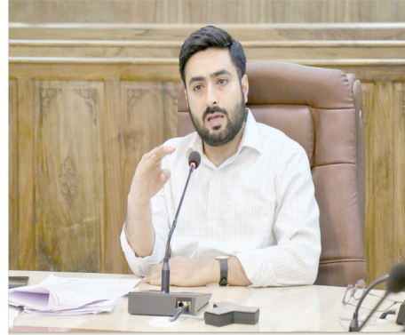
The DC underscored the importance of seamless coordination among various Departments for effective implementation

On the occasion, the DC stressed on conducting an impactful awareness campaign for one week in all Gram Panchayats to identify and cover the eligible youth under the initiative. Similarly, the DC asked for launching a comprehensive IEC campaign in all Municipal Wards in next 2 weeks under the scheme.