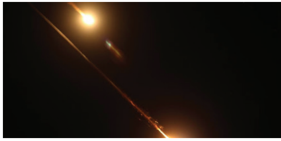
Safe Airspace also warned that other Gulf nations, such as Bahrain, Kuwait, Oman,

While there are no direct threats to civilian planes yet, the group said Iran might respond by targeting US military bases or using its allies, like Hezbollah.