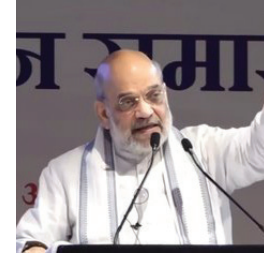
Speaking at the foundation stone laying ceremony

Union Home Minister Amit Shah on Sunday reiterated the government's resolve to eradicate Maoism by March 31 next year and announced that the rebels will not get a breather even during monsoon.