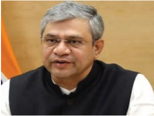
visit to flag off Katra-Srinagar

Speaking to reporters at Katra on his arrival a day before Prime Minister Narendra Modi's