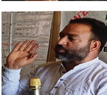
Participants were also informed about the scheme's broader support ecosystem,

which includes help with Detailed Project Report (DPR) preparation, bank loan facilitation, branding, packaging, and marketing support.