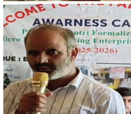
Farmer Producer Organizations (FPOs), and cooperatives