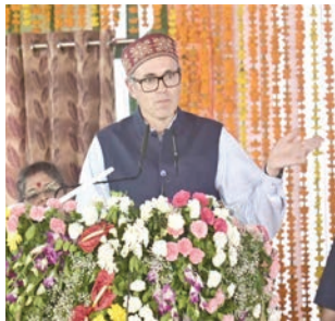
Bridges and at the flagging off ceremony of the Vande Bharat Train to Kashmir by the Prime Minister Narendra Modi.

The Chief Minister was addressing a large gathering at Katra during the inauguration of the Chenab and Anji